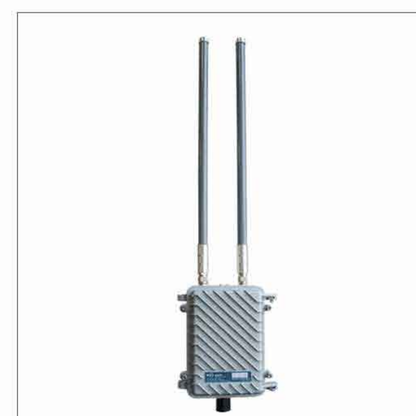
Rugged Outdoor Access Point UM 530 N