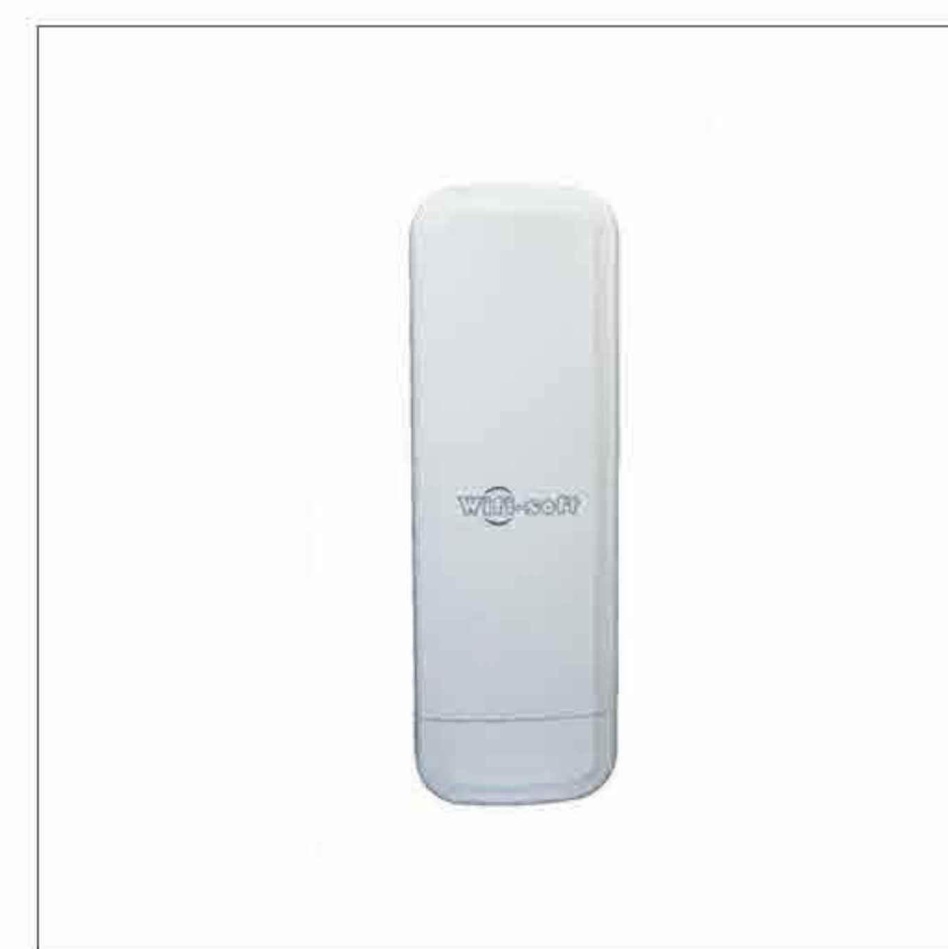
Outdoor Access Point UM 510 N

Lastly, Wifisoft engineers trained over 30 VNPT engineers, technicians on various topics like WiFi technology, network deployment, troubleshooting, portal page design and many other topics related to the management of public WiFi networks.