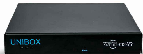
Unibox U100 Network Controller